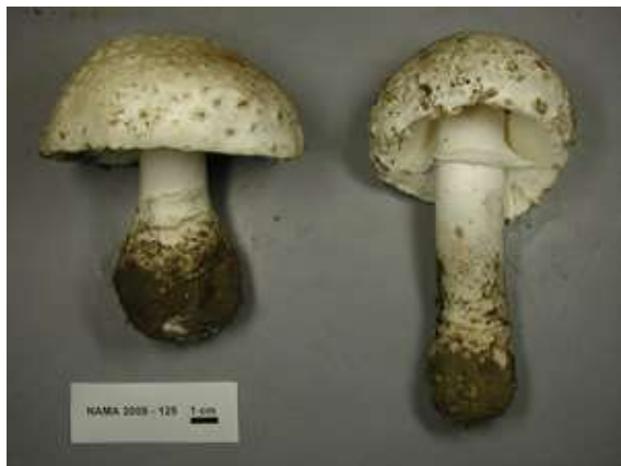
Amanita muscaria var. alba voucher photo

See diagram on Page 1 for the 'Assembly Line' for processing voucher specimens.